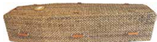
Banana Leaf – Coffin shape* (also available in Casket shape*) £995