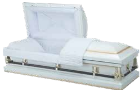
American-Style Caskets* American-style Caskets are available in wood or metal in a wide selection of designs From £1,470