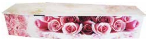
Reflections – Personalised Picture Coffins Choose from a ready-made design or design your own £920