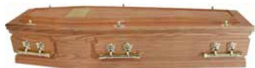
Westminster – Solid Oak (also available in Mahogany) £865