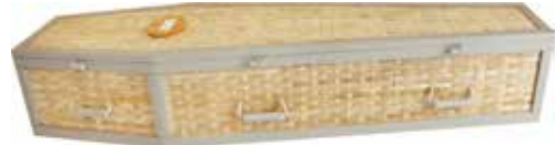
Premium Bamboo* £720